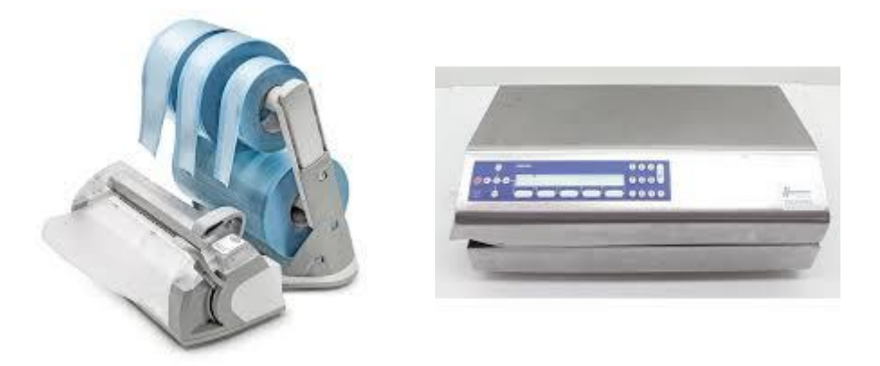
Figure 7: Typical heat sealers