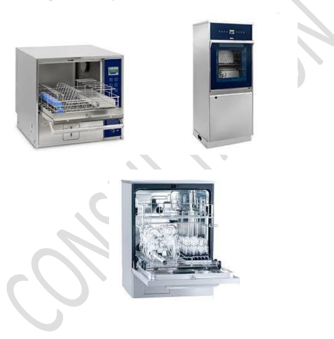
Figure 2: Benchtop, standalone and underbench washer disinfectors

4.6 The choice and number of washer disinfector is determined by throughput and performance requirements.