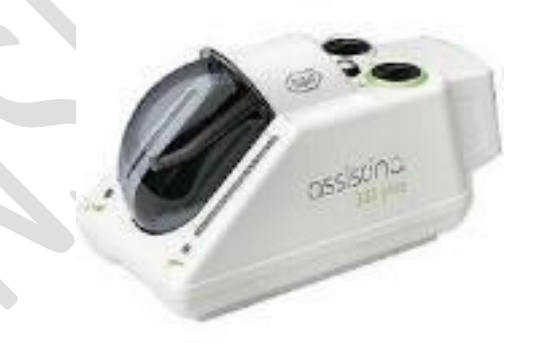
Figure 6: Typical dental handpiece lubricator

6.4 There are several varying types of lubricators on the market available that will provide automatic instrument maintenance. This is the preferred method to provide a repeatable process to ensure the correct functioning and long working life of dental instruments, e.g. handpieces.