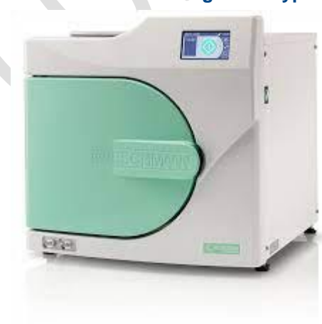
Figure 8: Type N and Type B sterilizer

7.6 The majority of steam sterilizers within the LDU setting are transportable bench-top models which are electrically heated, requiring only a 13A socket and no piped services, see Figure 8 .