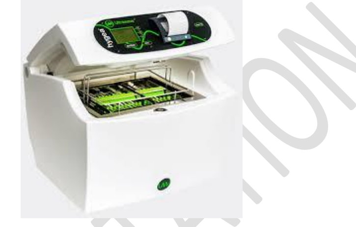
Figure 5: Standalone Ultrasonic cleaner

5.1 An Ultrasonic Cleaner (UC) within an LDU environment is usually a stand-alone ultrasonic bath. Ultrasonic cleaners are not intended for routine use but may be used as a backup automated cleaning process in the event of washer disinfector (WD) failure and as a cleaning process before cleaning and disinfection in a WD for dental instruments. Ultrasonic cleaners do not incorporate a disinfection stage.