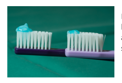
Image illustrating a pea sized amount of toothpaste on the left which is suitable for children over the age of 3 and adults. A smear of toothpaste is shown on the right which is suitable for children under the age of 3.